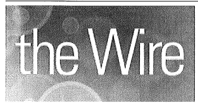
The Wire Newsletter

Read energy-saving tips and other helpful information here each week.