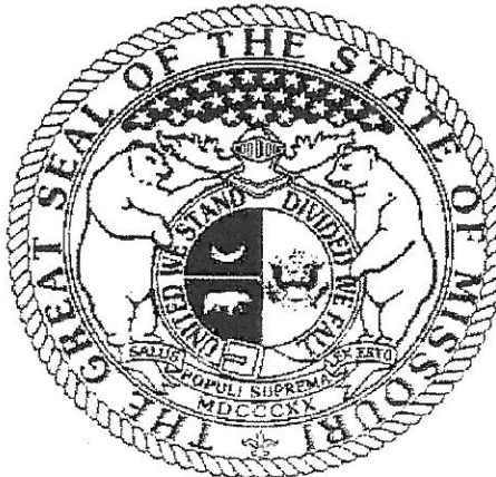
Secretary of State

Certification Number: 15617614-J Reference: