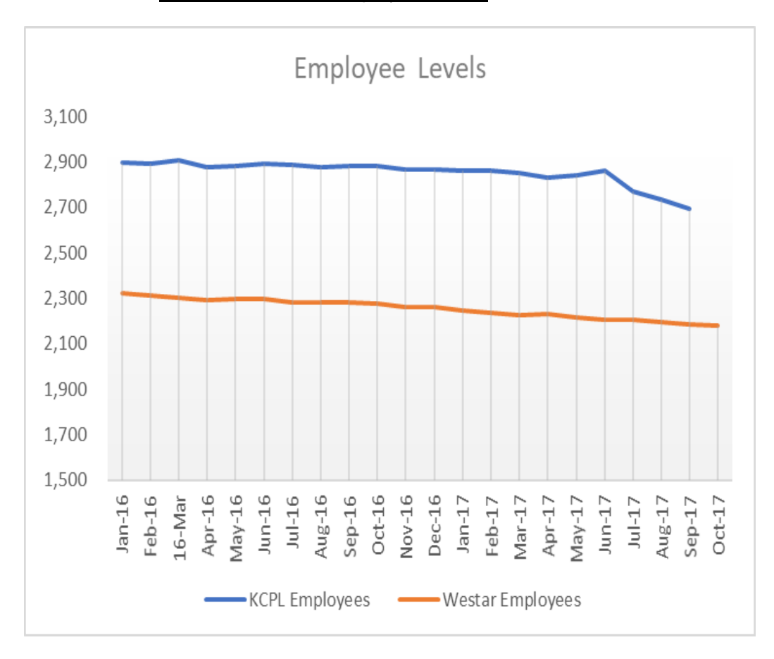
Table 1: KCPL and Westar Employee Levels<sup>15</sup>

Actual employee headcounts at KCPL<sup>14</sup> and Westar have been reduced significantly since 2016, as a result of selective hiring to fill vacant positions and management's attention to reducing staffing levels while minimizing future severance costs. The following graph illustrates Great Plains/KCPL and Westar staffing trends since January 2016: