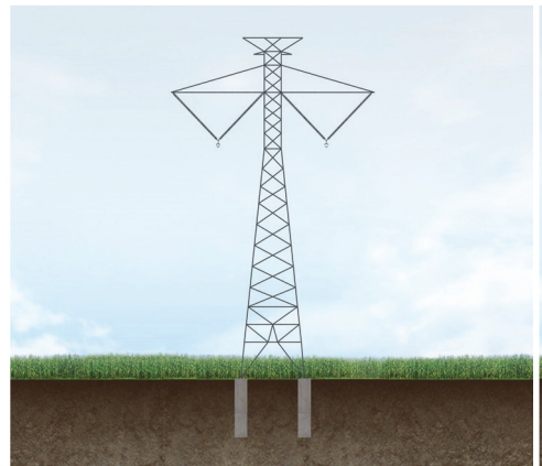
$1,500 annually or $18,000 one time