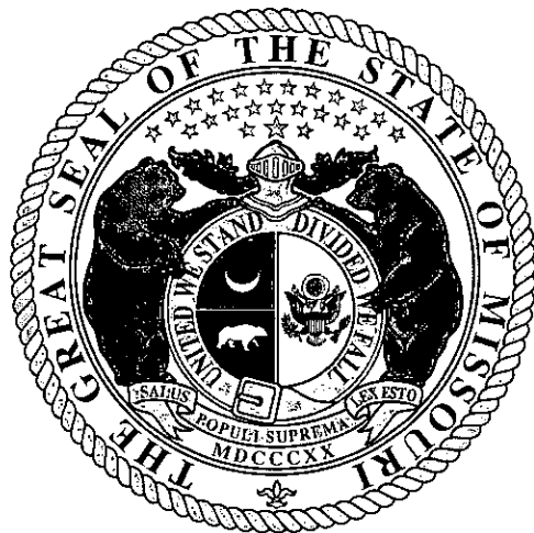
Secretary of State

Certification Number: 9196087-1 Reference: