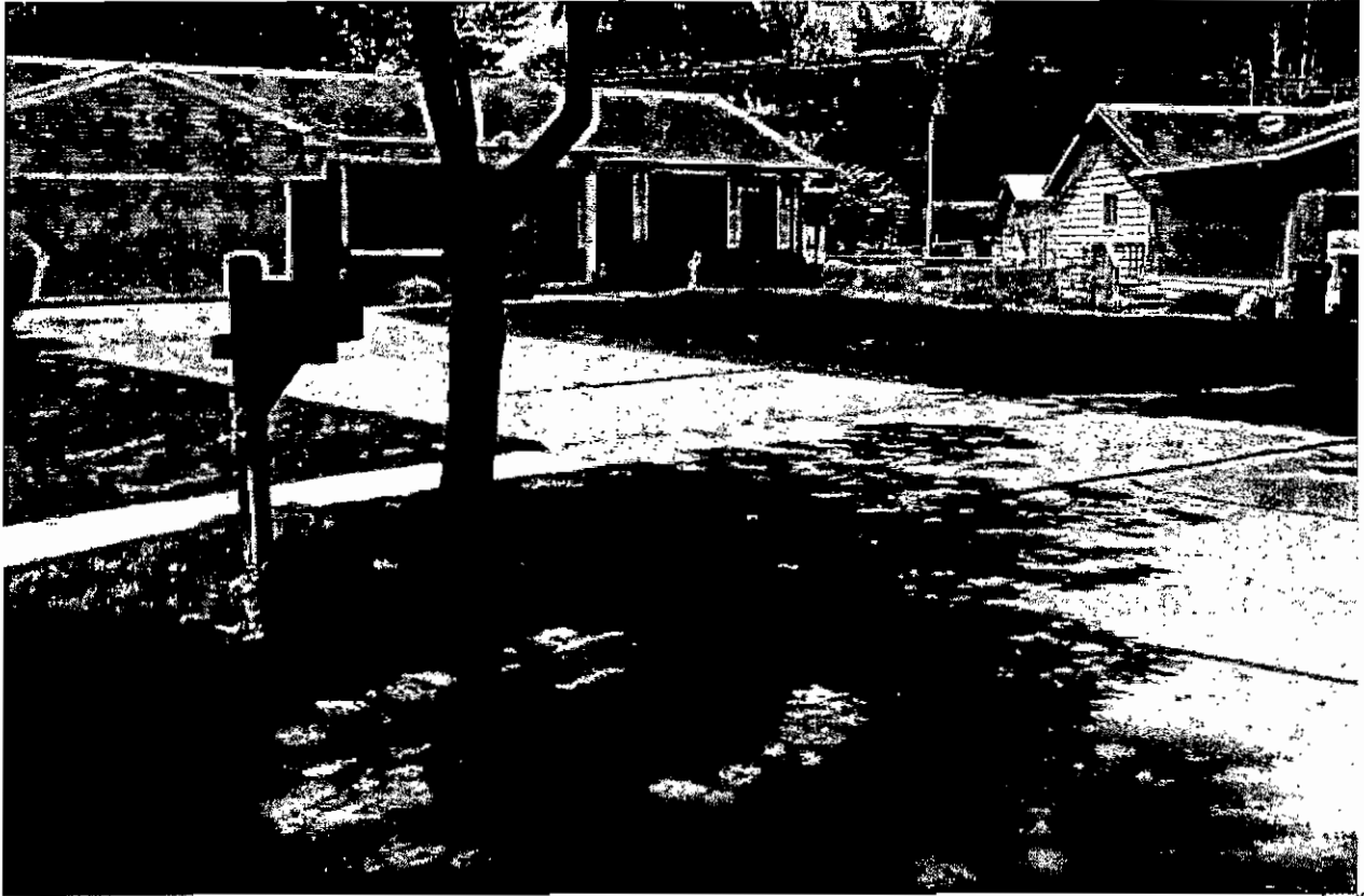
Exhibit No. 10B Date _____ Case No. _____ Reporter _____