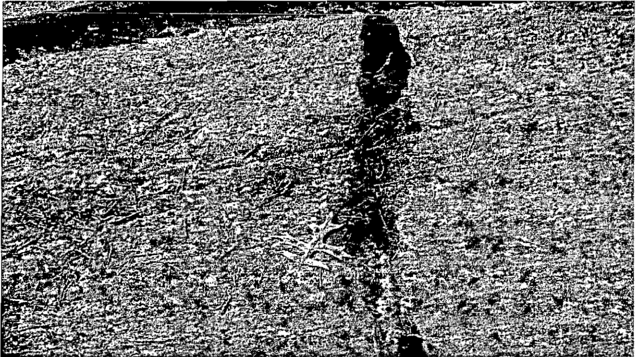
These three below were taken on May 18, 2009 After no rain for at least four days