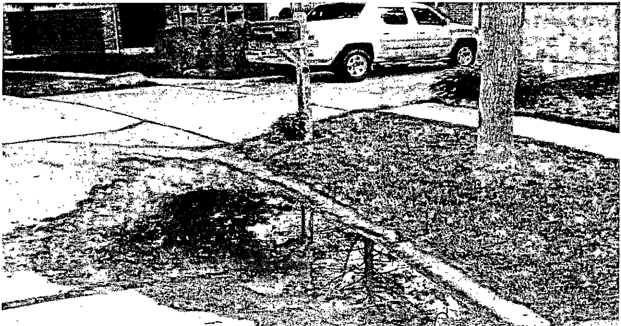
Exhibit No. 10A Date 6-9-09 Case No. WC-2009-00 Reporter PR