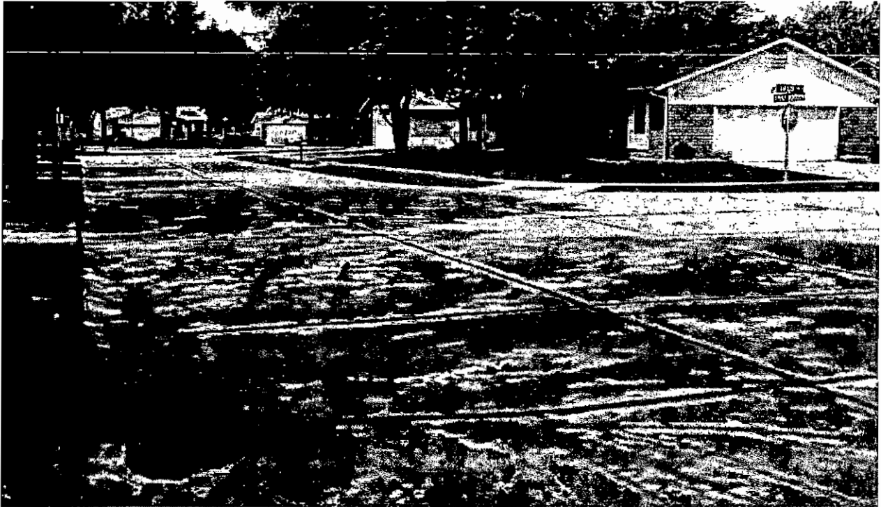
In front of 11307 This leak started after the black square appeared the street one property to the south.