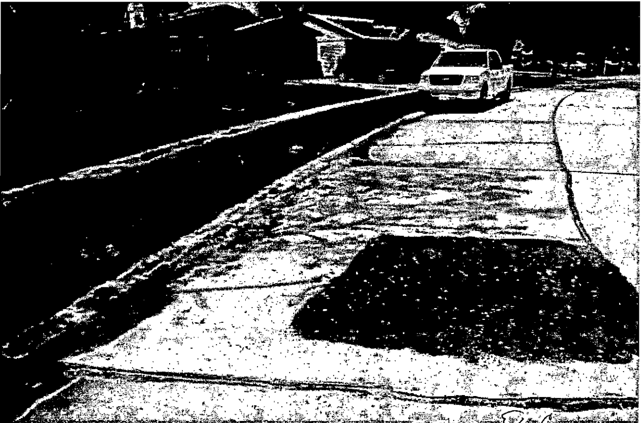
Exhibit No. 8C Date _____ Case No. _____ Reporter _____