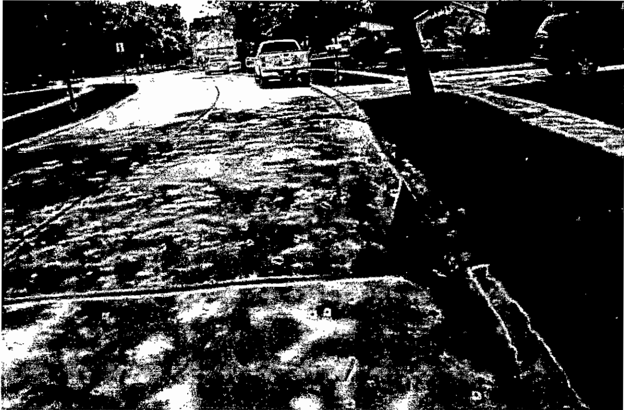
Exhibit No. SR Date ..... Case No. .... Reporter .....