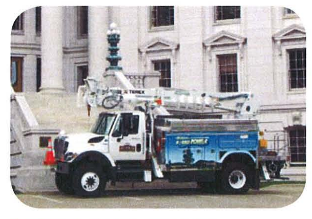
Plymouth Utilities' plug-in hybrid electric utility line truck.

$15 million in Recovery Act funds to help