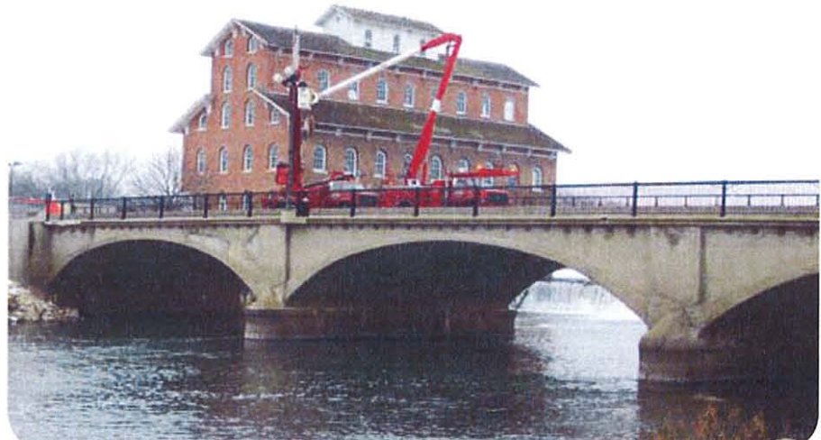
New light fixtures on the bridge near the Wapsipinicon Mill are installed.