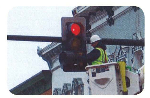
Routine maintenance on traffic lights.

and drawings for LED holiday lights and compact fluorescent lights. Public Power Week allows the utility to celebrate the value of having a community-owned electric system to power local needs and provide excellent customer service.