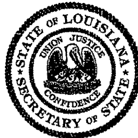
Secretary of State 34577625D