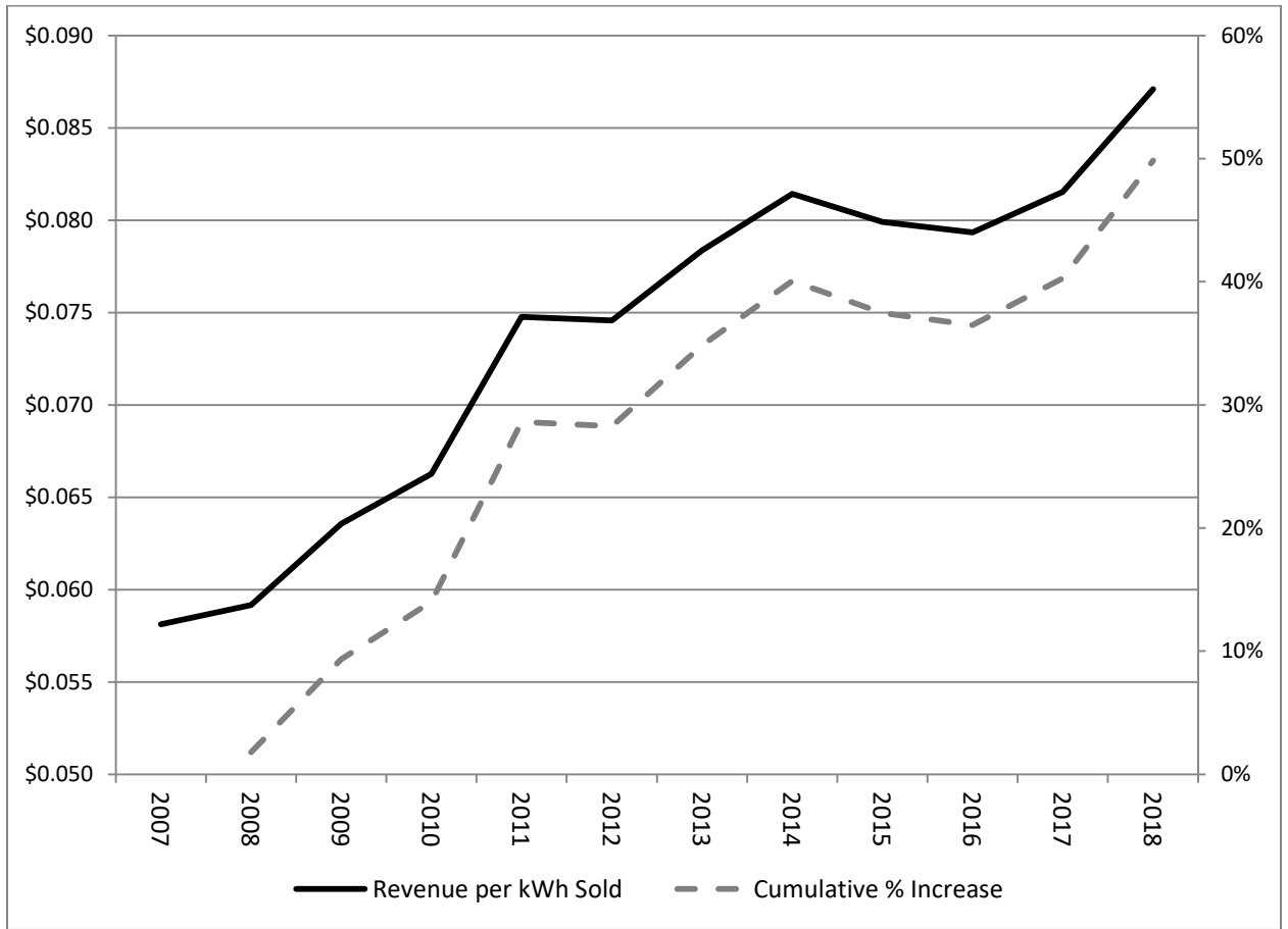
Figure 2. FERC Form 1 Reported LP Revenue Per kWh Sold and Cumulative Percent Increase, 2007 - 2018. Source: Exhibit SWC-3