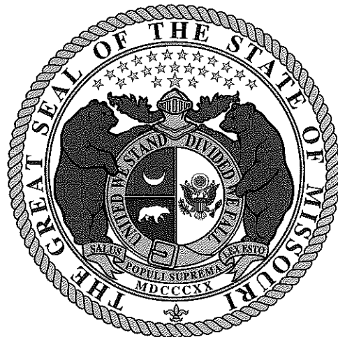
Secretary of State

Certification Number: 12443425-1 Reference: Verify this certificate online at http://www.sos.mo.gov/businessentity/verification