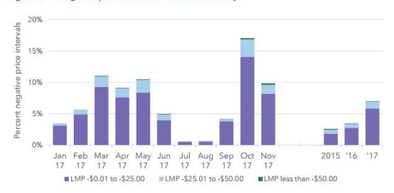
Figure 6-1 Negative price intervals, real-time, monthly

Negative prices can occur when renewable resources need to be backed down in order for traditional resources to meet their scheduled generation. According to SPP's Market Monitor, unit commitment differences, the significant increase in the level of renewable generation, and the abundance of capacity will likely lead to changes in market rules to address self-committing of resources in the day-ahead market.<sup>30</sup> It is not clear how market rule changes would impact Empire's Customer Savings Plan assumptions.