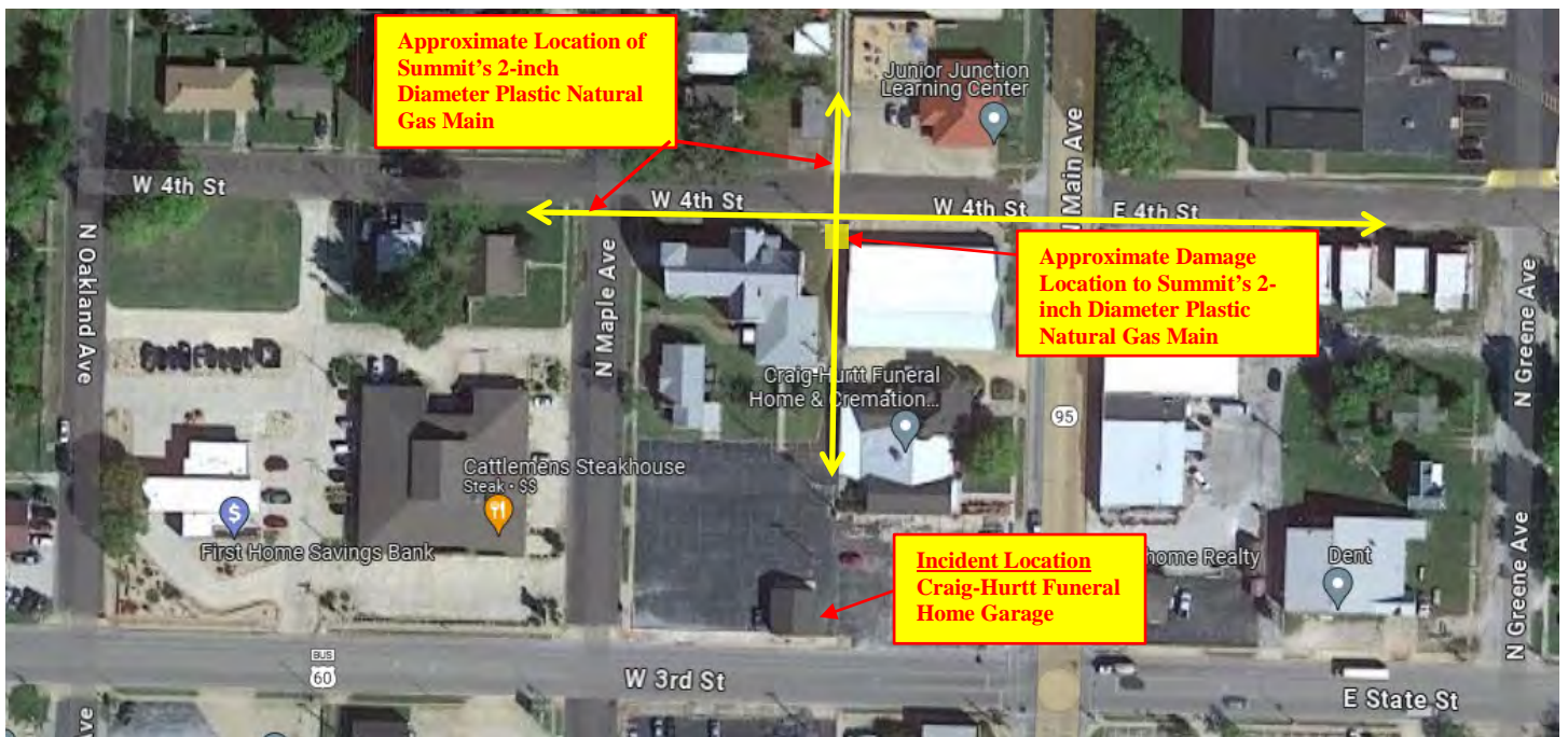
Figure 3: Satellite view showing the approximate location of the June 26, 2023 natural gas incident at the Craig-Hurt Funeral Home garage in Mountain Grove, Missouri, and the approximate location of damage to Summit's 2-inch diameter plastic natural gas main, Map View ( Source: Google Maps; text boxes and arrows added by Staff)