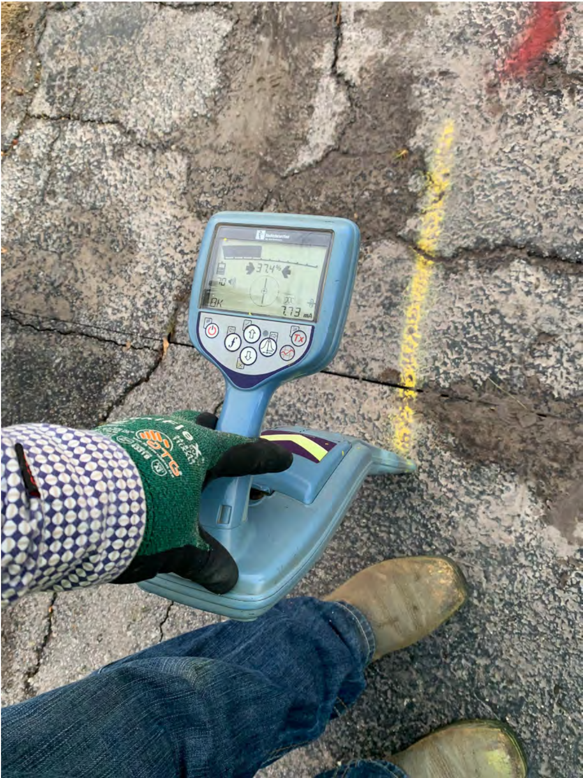
Figure 7: Photograph of SNGMO locating its' natural gas main following the incident to verify the accuracy of previously painted locate lines at the location of the incident.