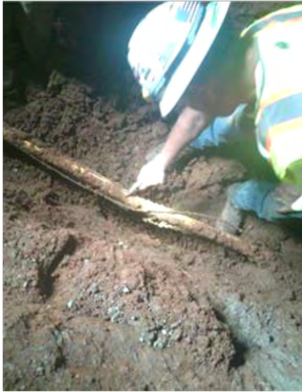
Figure 4: Photograph of Summit's 2-inch diameter plastic natural gas main and tracer wire that was damaged by A&A Cable (contractor working for MasTec) on June 26, 2023 during a directional bore operation. The damage location occurred just south of W 4 th Street in an alley between N Maple Avenue and N Main Avenue in Mountain Grove, Missouri.