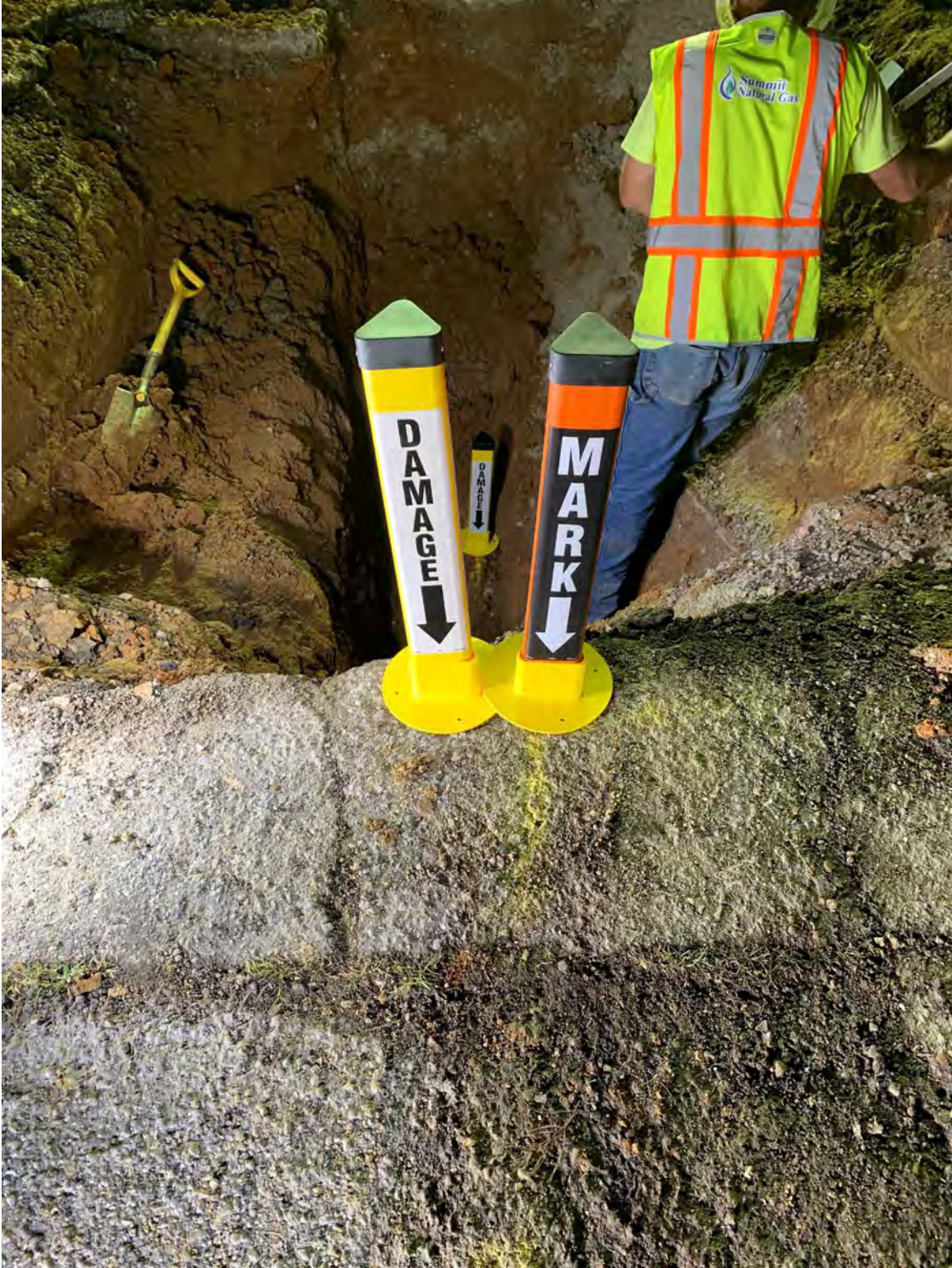
Figure 6: Photograph showing view of Summit’s 2-inch diameter plastic natural gas main, exposed where the damage occurred. “DAMAGE” cones were placed above the located natural gas main, and a “MARK” cone was placed above locate lines painted on the ground.

on June 26, 2023 in Mountain Grove, Missouri.