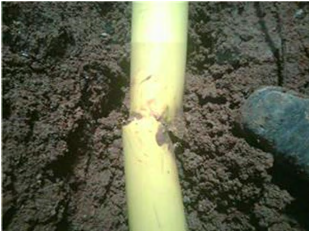
Figure 5: Photograph of Summit's 2-inch diameter plastic natural gas main that was damaged by A&A Cable