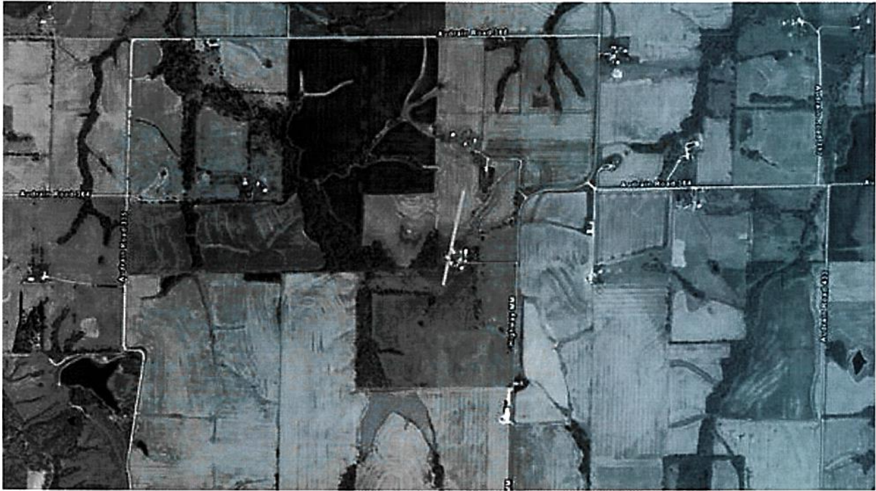
Audrain County for.png

by Ashley Cade | Thu, April 24th 2025 at 2:33 PM Updated Thu, April 24th 2025 at 2:33 PM