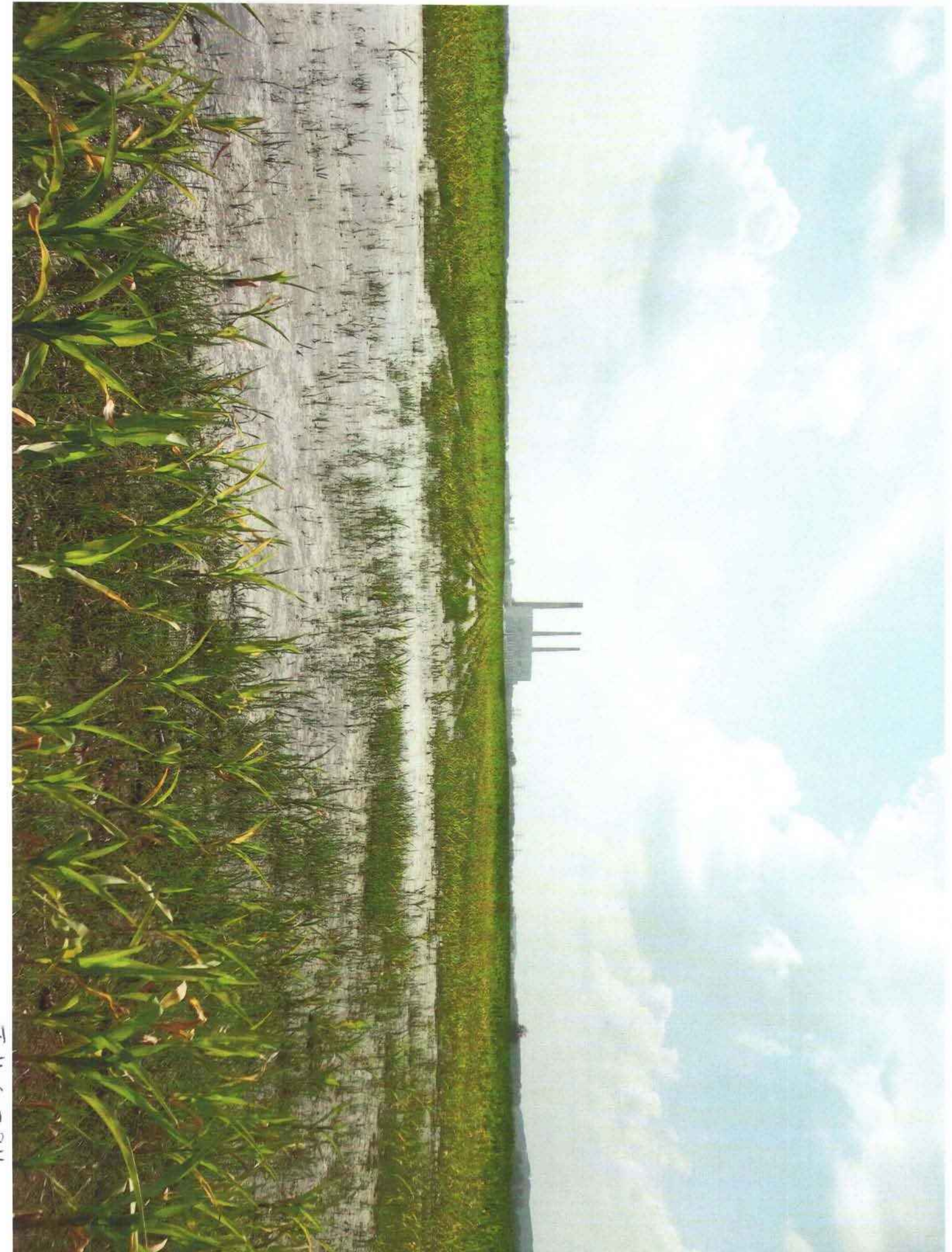
J-13 6, 2011